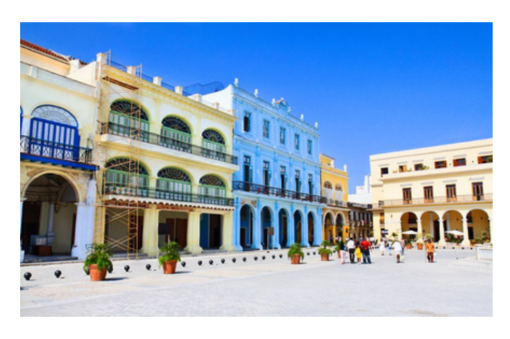
Old Havana (Habana Vieja)